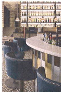
Front bar to be clad in a variety of metallic sheet finishes and laid in a vertical format. Bar stools to be upholstered in accent colour, with metal stud detailing to edges. Off white stone effect Colson countertop.