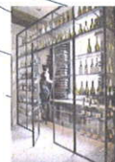
Grated wine route with open display shelving to perimeter.