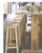
High bench oak tables with pendant lighting above to entrance area for coffee / juice bar / patisserie.