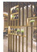
Timber screening separating bar lounge and restaurant, with display shelving sections.