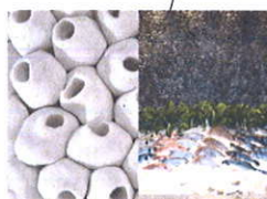
Cladding to large seafood display table with a sculptured effect facade design. Concealed recessed LED tape light to underside of countertop to wash down facade. Large seafood display to have clear toughened safety glass surround to edge. Ice well trays to be illuminated for evening service.