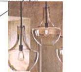
Clear glass pendant lamps suspended over glazed roof at various heights.