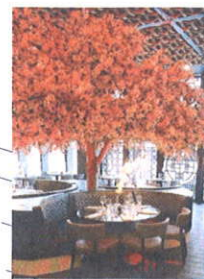
Circular banquet cluster with central feature tree extending into pitched roof section. Pendants over each table.