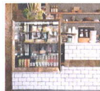
Perimeter display cabinet set into end of bar. Large toughened safety glass display unit with metallic trim to perimeter edges. Internal glass shelving.