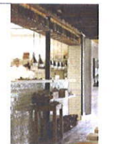
Large open kitchen and raw bar with white metro tile cladding to facade and zinc countertop. Heat lamps to be suspended from soffits.