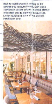
Back wall banquet halling to be upholstered in neutral tones, with loose cushions in accent colours. Central planter with small trees to separate banquette. Linear sculptured wave effect artwork installation over.