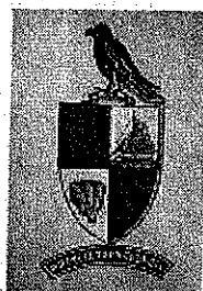
The Wivenhoe Encyclopedia