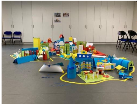
3D map of the city created during the Youth Takeover event.

City status for Colchester has engaged the imagination of local young people. In July last year the Mercury Theatre held a Youth Takeover event, part-funded by the Council, and a key aim of this event was to find out what local young people felt about their new city. The event included DJ workshops, a Make your own Podcast; Arts & Crafts; Live Music; and a Panel Discussion.