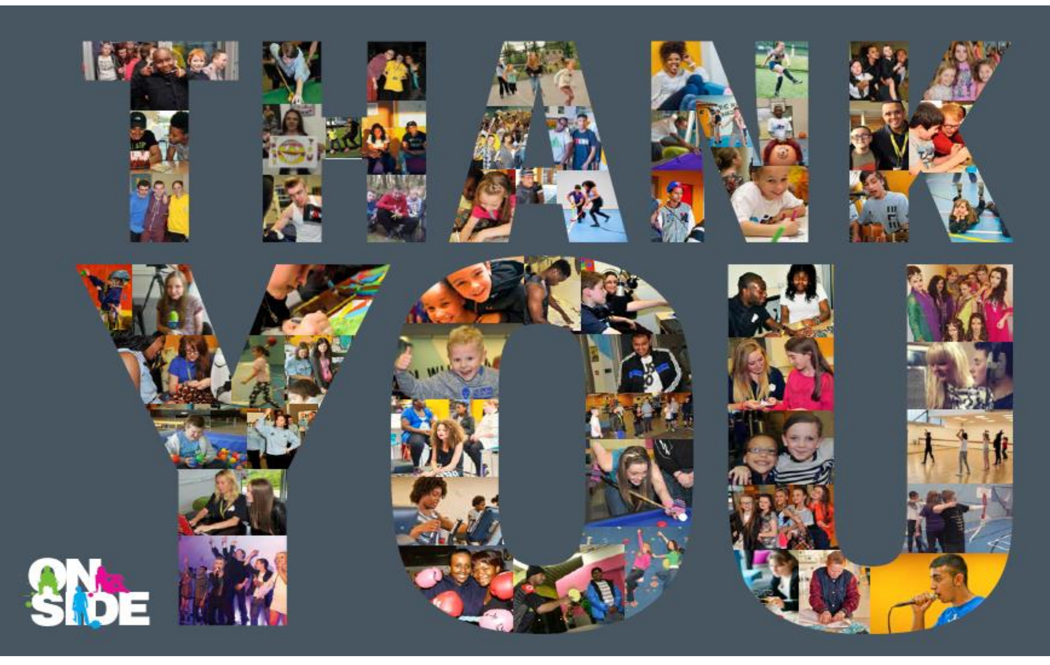
Page 30 of 36