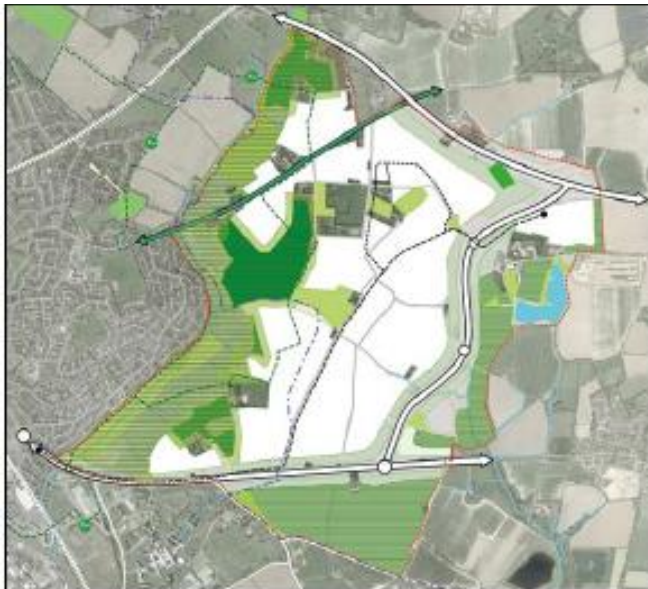
Figure 4.3: Masterplan Diagram for Option 3, Approach A: Maximum Landscape

4.24 The Masterplan Design Options Report also identified one additional sub-option for the spatial distribution of development at the Garden Community. This option represents a variation of option 3 above. The option is detailed in the Council's Spatial Options Report and is summarised below: