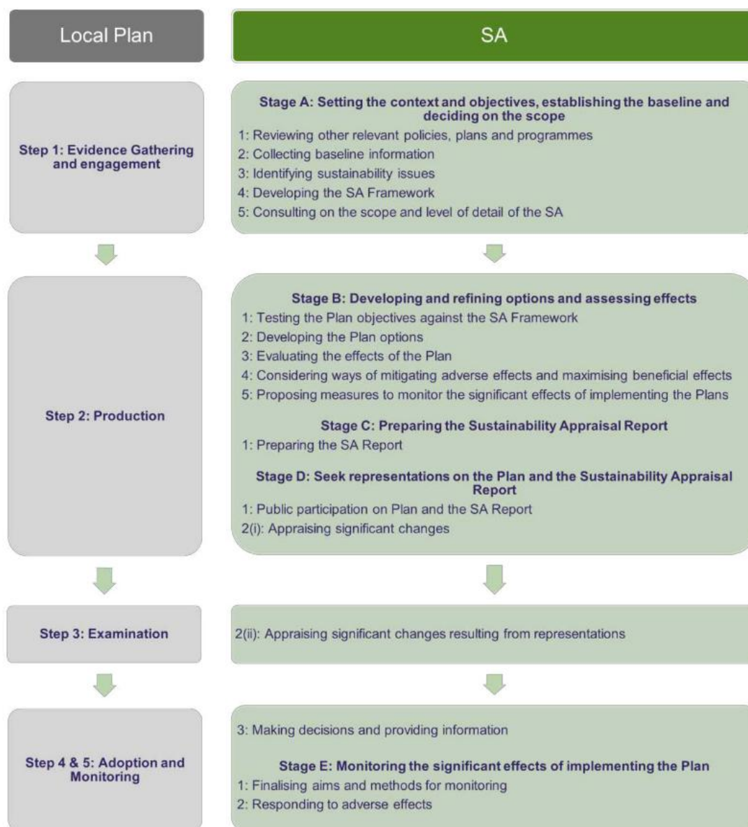
Figure 2.1: Corresponding stages in plan-making and SA

2.2 The sections below describe the approach that has been taken to the SA of the DPD to date and provide information on the subsequent stages of the process.