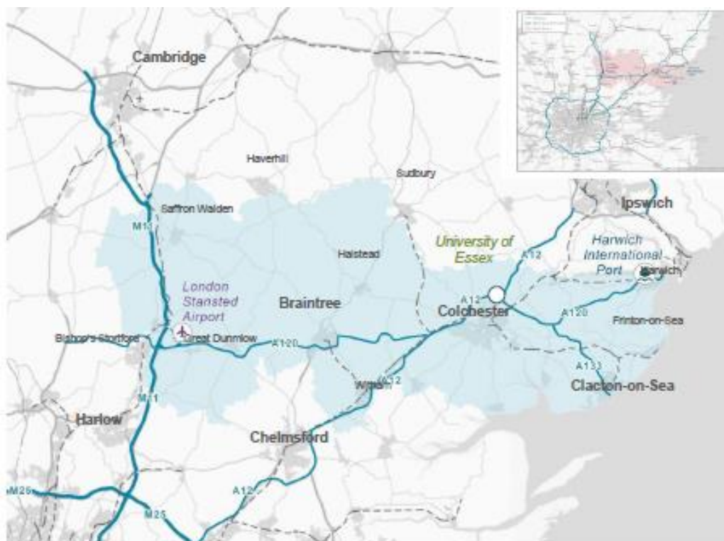
Figure 1-1: North Essex in context