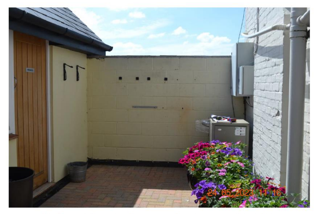
Site for new toilet as viewed from covered way to accommodation block