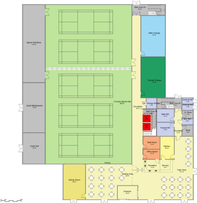
1 Ground Floor Plan 1 : 200