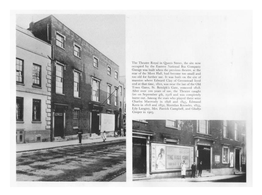
Figure 1: illustration of the former Theatre Royal on this site.

The location of the proposed scheme is as indicated in figures 2-4: