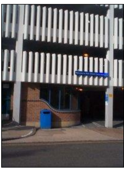
Example Cycle Centre: Park Street Cycle Park Cambridge

Photos: Cambridge Cycle Campaign (Simon Nuttall) <a href="https://www.camcycle.org.uk/resources/cycleparking/parkstreet/">https://www.camcycle.org.uk/resources/cycleparking/parkstreet/</a>