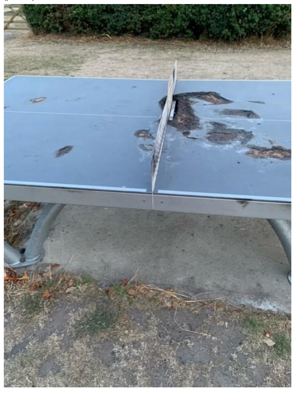
The burnt table tennis, done by out of had teenagers I understand (photo 2)