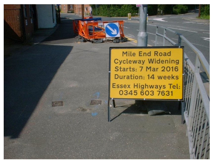
'Work commencing' signage